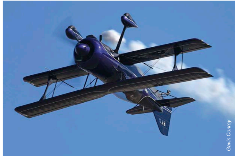
John Eaton's 360hp radial powered Model 12 Pitts - Gavin Conroy photograph.

You might think that some pilots will never need aerobatic training – what would a pilot of a basic microlight, or an Airbus A380, or a glider pilot need with aerobatic training? “I just want to get my PPL to take my friends/family/workmates (delete as required) to Wanaka/Pauanui/Martinborough (delete as required), for a nice day out”. That’s as good a reason as any to learn to fly, but how safely do you want to do this? A plane is not a car – you can’t just pull over to the side