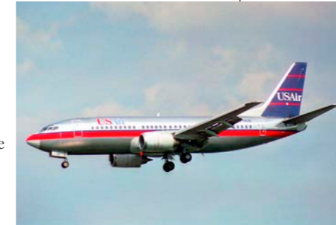
A USAir 737-300 (above) and the 737 Hardover (right).

The recovery from this situation may seem counter-intuitive, but this is where the benefit of aerobatic training comes in. After applying full rudder opposite to the direction of yaw, you must push forward – all the way, depending on the aircraft type - to reduce the angle of attack. That is the hard bit – the nose is already pointing down yet you must now push the stick even further nose-down. You must also centralise the ailerons, despite the roll you are witnessing, to remove any drag-couple that may be keeping the auto-rotation of the spin going. With airspeed increasing and the yaw/roll slowing down, both wings should start flying again, and the effectiveness of all the flight controls increases every second the plane is accelerating. Now you can use the ailerons to roll the wings level, and with the lift vector pointing back upright