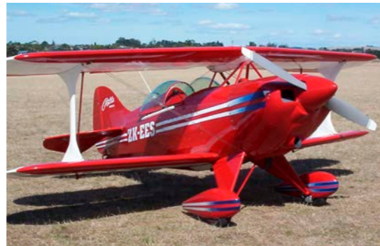
Pitts S-1 Special ZK-EES

With an empty weight of just 807lbs, performance is very spirited, but equally the light and dainty handling of the S1 Pitts aircraft is truly endearing, making their popularity understandable.