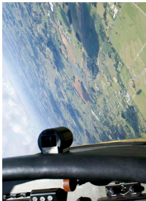
Where was it again?

taking a break, climbing for height and giving yourself time to figure what went wrong but more particularly where to start off again, in the right direction and at the right speed and height. There is no rush, and many times I have seen people take a break only to be starting in the wrong direction, or with insufficient speed and/or height. You do get a penalty for taking a break, but if you subsequently 'zero' every following manoeuvre for flying them in the wrong direction, you will really be kicking yourself. And the poker-face judges will probably just say to you, over the lunch break, "That looked like fun"!