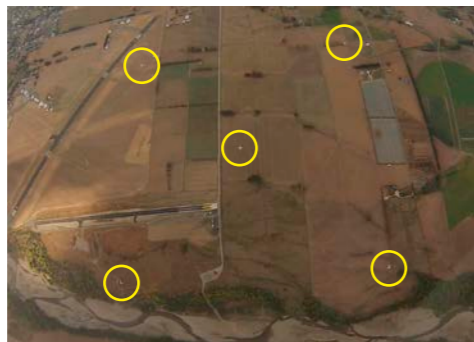
Ground markers identify the box location.

Despite all your best efforts, you may/will get lost - in the sequence or geographically. It is not the end of the world or even the end of your chances of glory. In competition aerobatics there is a saying 'He who finishes with no zeros, wins', which can be true, but conversely in some programmes we see everybody have a 'zero' score for a manoeuvre or two, which levels the playing field again. NEVER GIVE UP!. The secret is to recover 'well', which means