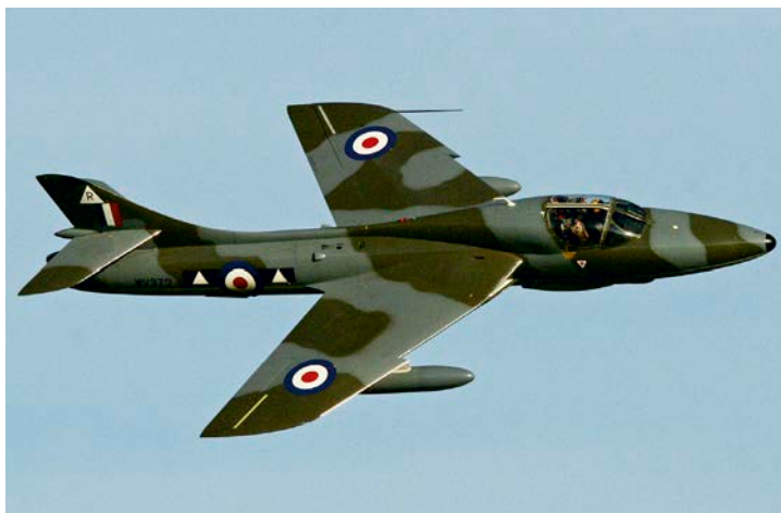
A photo of the 'Shoreham Hunter' in happier times. The aircraft was destroyed in 2015 at a UK airshow in a tragic accident claiming 11 lives.

Ultimately, it's as bad as things can get when you either a) hit the ground in your airplane, or b) hit the ground out of your airplane (it having already fallen to bits).